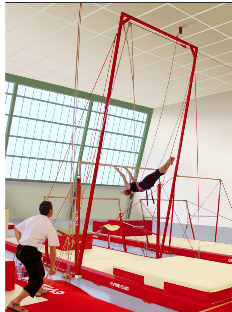
Spotting frame for training on asymmetric bars