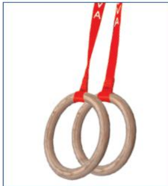
Anneaux en bois multiplis