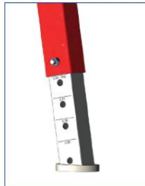
Pieds réglables en hauteur