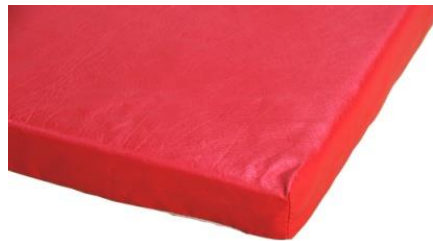
Without reinforced corners