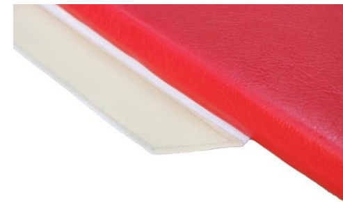
Hook and loop